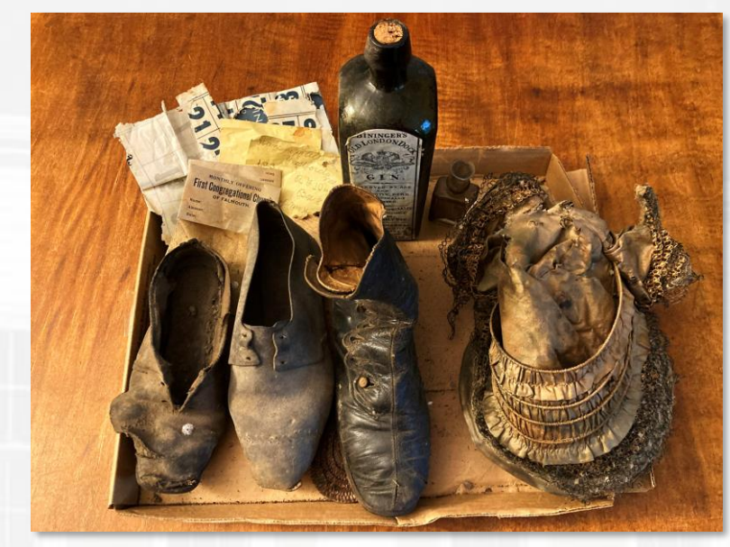
Items Date to Mid-19th Century

• Placing shoes in the attic to ward off "evil spirits" is an old English custom