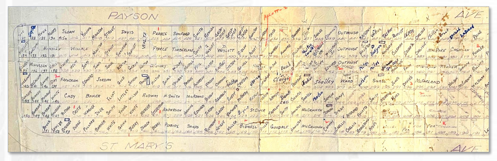
Pine Grove Cemetery

Appears to contain surname and actual locations that Find-A-Grave and MOCA don't have